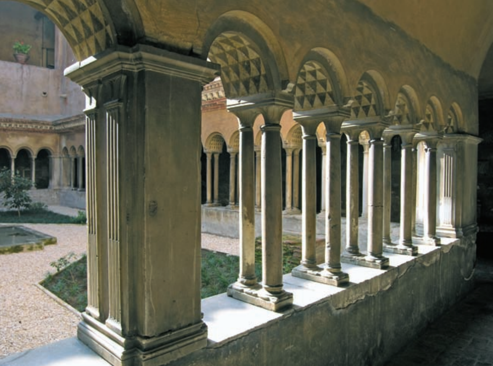
OPENING SPREAD AND ABOVE, RADICAL MEASURES TAKEN TO LIMIT MOISTURE EXPOSURE AND ARREST DECAY ARE FAR FROM NOTICEABLE IN SANTI QUATTRO CORONATI'S NEWLY RESTORED AND LANDSCAPED CLOISTER. BELOW, THE ENTRANCE AND BELL TOWER OF THE MONASTERY COMPLEX.