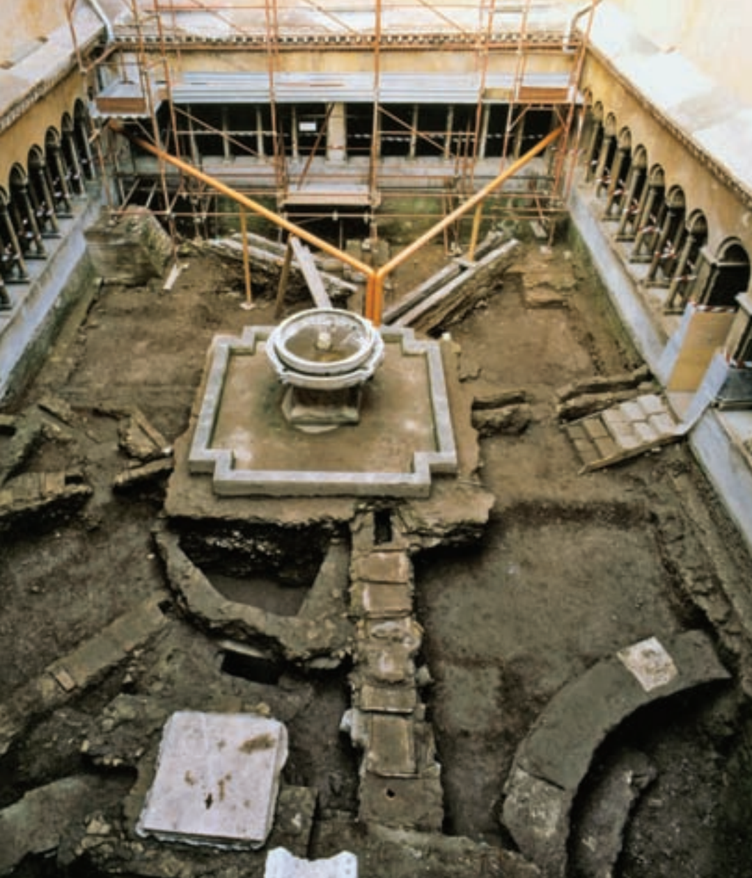
FACING PAGE CLOCKWISE FROM TOP: AN ELEVENTH-CENTURY FOUNTAIN GRACES THE NEWLY RESTORED CLOISTER, WHILE ARCHAEOLOGICAL FRAGMENTS COLLECTED DURING A RESTORATION IN THE EARLY TWENTIETH CENTURY ADORN THE CLOISTER'S INNER WALLS; THE ENTRANCE TO THE CHAPEL OF ST. SYLVESTER. THIS PAGE CLOCKWISE FROM TOP: ARCHAEOLOGISTS HAD TO EXCAVATE THE ENTIRE CLOISTER TO REACH MORE ANCIENT CISTERNS AND WATERWORKS, THE PRIMARY SOURCE OF DAMAGING MOISTURE, EVIDENT IN A COSMATI FRIEZE SURROUNDING THE COURTYARD. CONSERVATORS REMOVED MASONRY TO INSTALL TIE BEAMS.