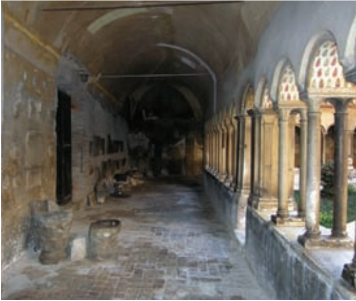
PRIOR TO RESTORATION, WATER DAMAGE WAS EVIDENT IN THE FLOOR AND WALLS OF THE ARCADE SURROUNDING THE CLOISTER, ABOVE. BEFORE CONSERVATION BEGAN, ARCHAEOLOGISTS CLEANED ARTIFACTS CAREFULLY EXCAVATED FROM THE THIRTEENTH-CENTURY CLOISTER.

complemented by support from Sparaco Spartaco SpA and the Provincia di Roma.