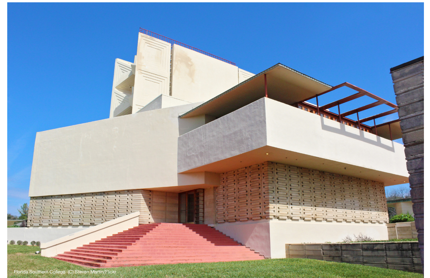
Florida Southern College

The ten sites selected for Irreplaceable America will be announced in July 2026. All nominations to Irreplaceable America will also qualify to compete on a global stage for inclusion on the 2027 World Monuments Watch, which will be announced in February 2027.