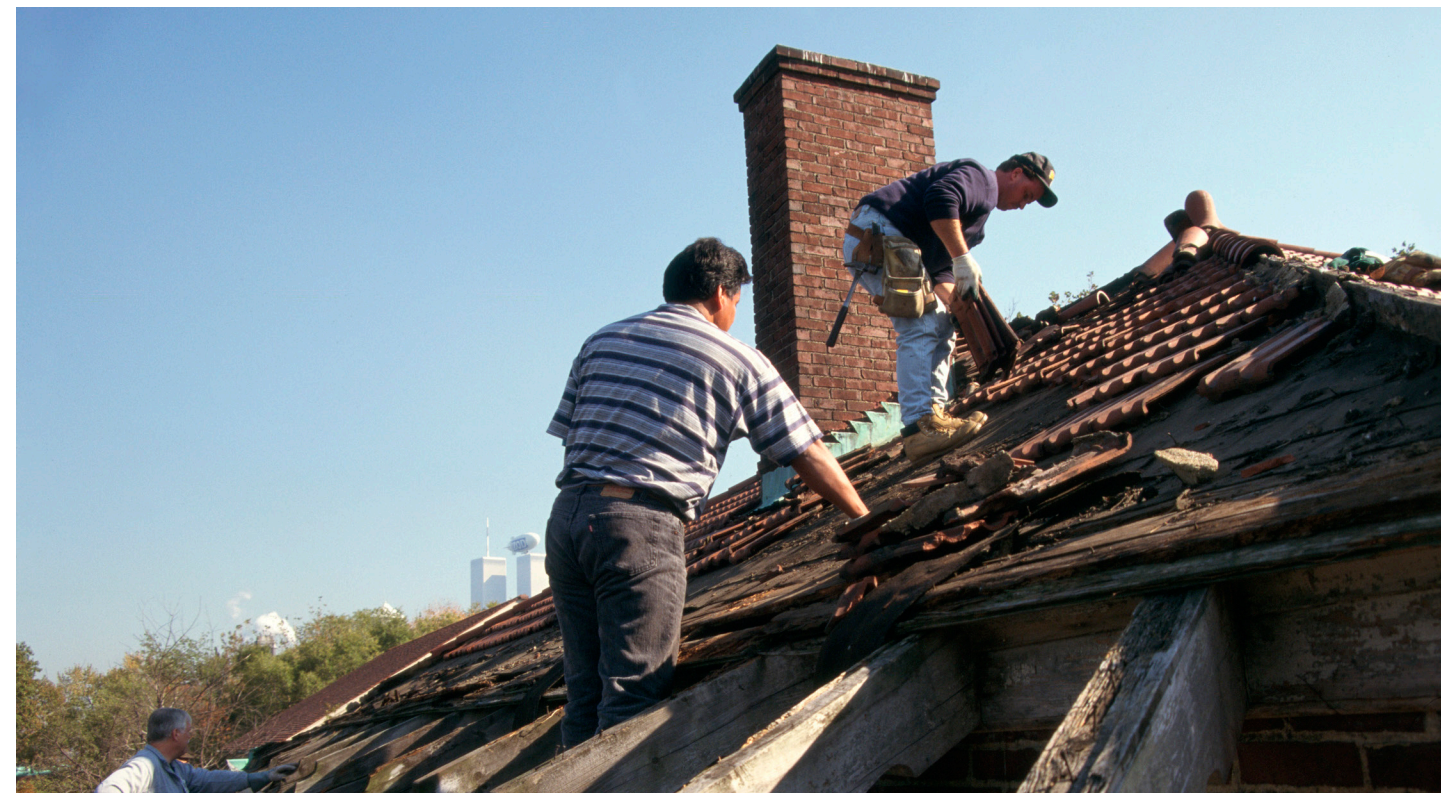
Ellis Island, New York City.

The Central Aguirre Historic District was included on the 2020 Watch following severe damage from Hurricane Maria, which devastated the wooden-frame houses of this former company town on Puerto Rico's southern coast. Through the Watch, WMF has worked with local partners to stabilize historic buildings, train residents in traditional carpentry and wood construction, and build capacity for long-term recovery that links heritage preservation with community resilience.