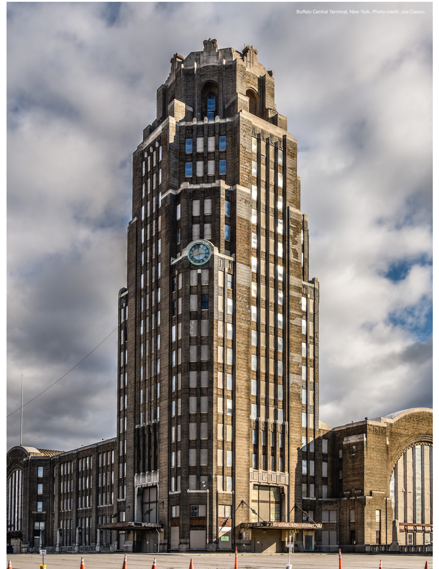
Buffalo Central Terminal, New York.

Following the announcement, WMF will work with selected sites and their nominators to raise awareness and develop strategies for advocacy, conservation, community engagement, and fundraising. These collaborations will help advance preservation initiatives that strengthen connections between people and places across the United States.