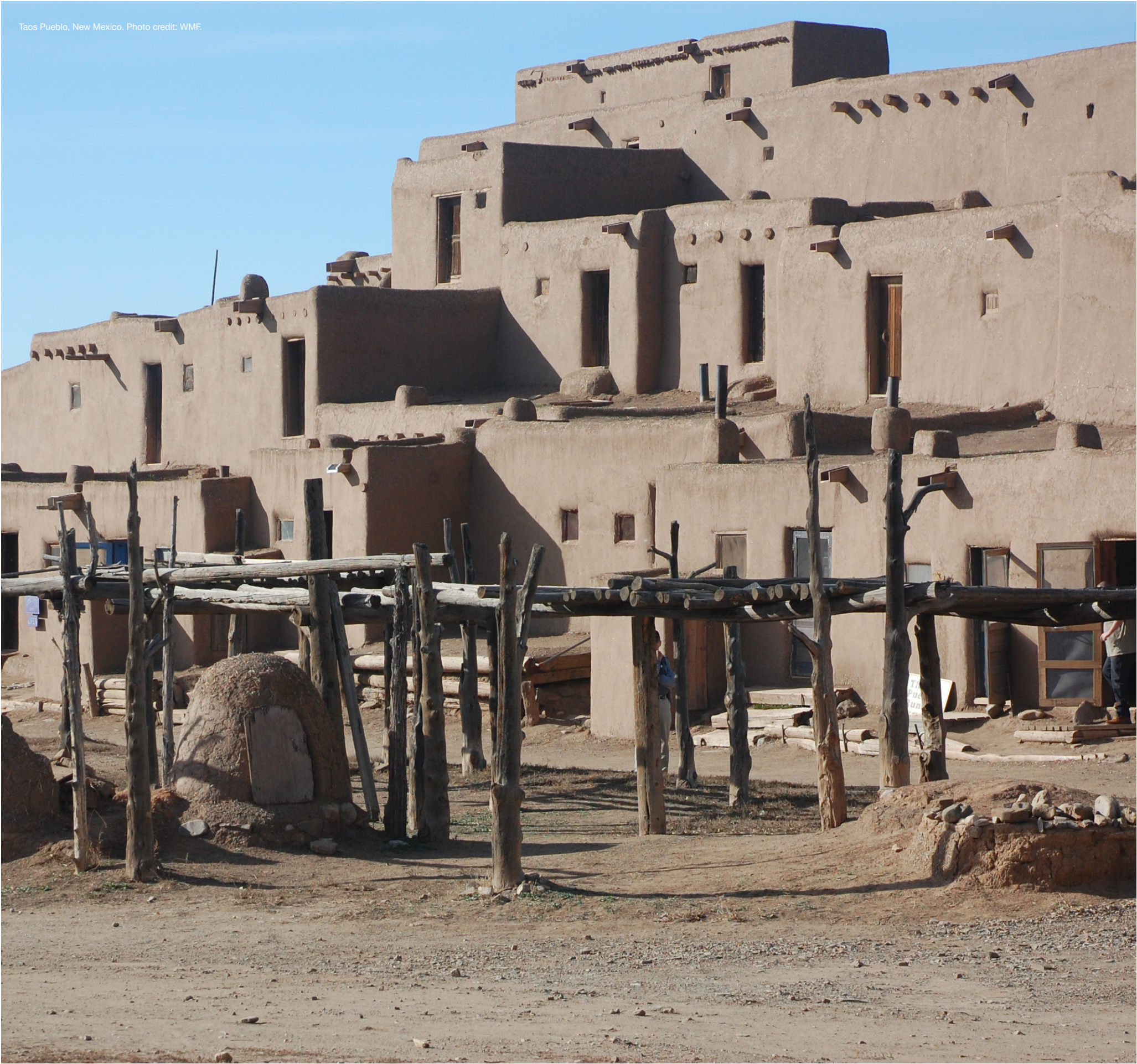
Taos Pueblo, New Mexico.