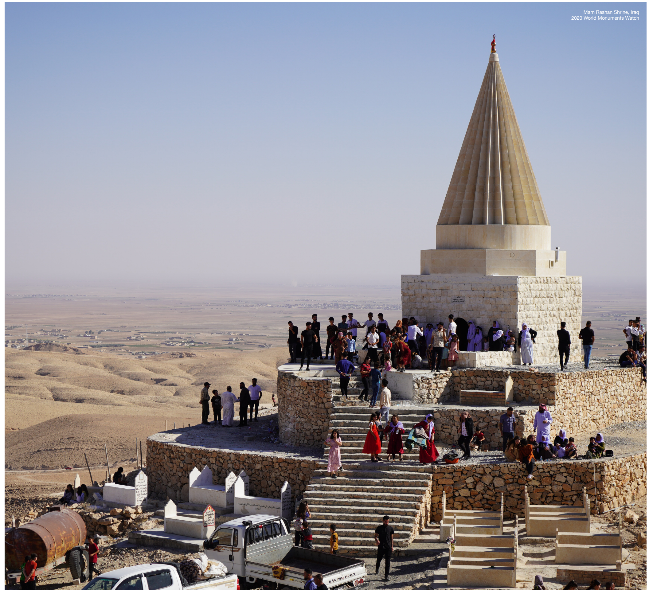
Mam Rasha Shrine, Iraq 2020 World Monuments Watch